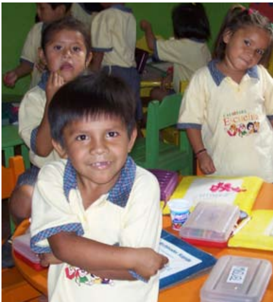
Top Left: Casa de Sara's "Montessori-style" classroom in action. Top Right: Children playing on new playground equipment. Bottom: Some of the happy faces found at the Casa de Sara Escuelita.